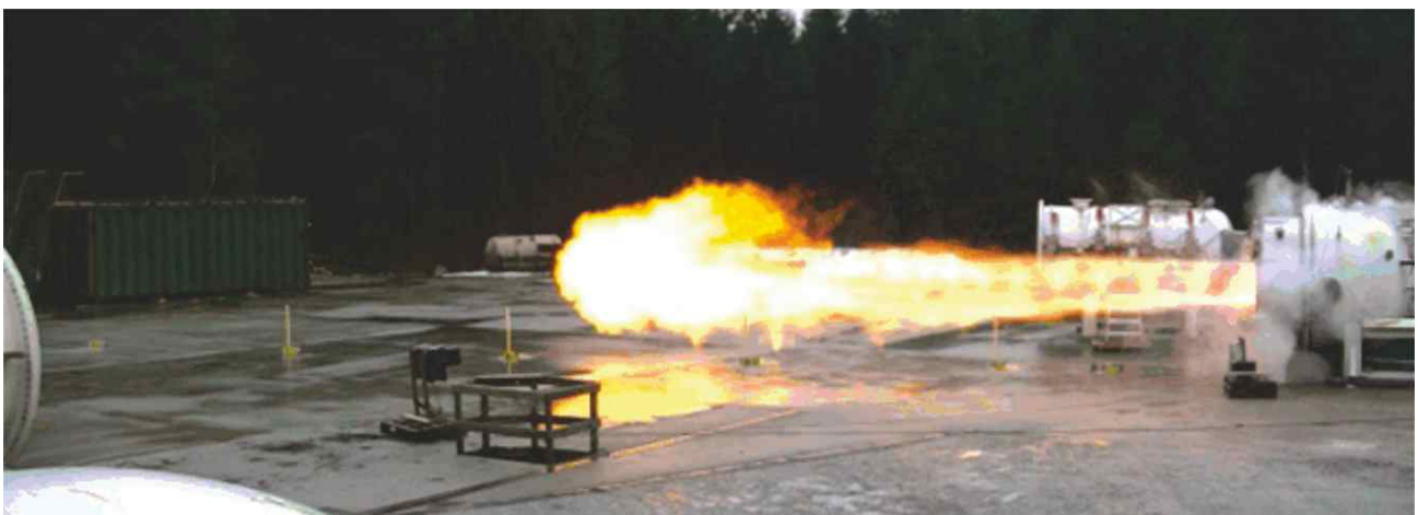
A confined and vented dust explosion

In manufacturing and handling process industries in flammable and combustible atmospheres, the threat of static electricity is ever present. There are certain types of dust handling plant equipment in which static electricity is readily generated. These include mills, conveyor belts and pneumatic conveying systems. In potentially explosive atmospheres, the amount of energy contained in spark discharges from plant, equipment and even people may be sufficient to ignite many fine dusts produced during handling loose solids such as powder, granules, pellets and flakes. Electrostatic charging of isolated plant equipment or materials is likely when moving dusty materials in quantity. It is fundamentally critical to take necessary precautions to mitigate discharges that are powerful enough to cause ignition of a dust cloud. All potential sources of internal and external static discharges from process equipment situated in zoned and