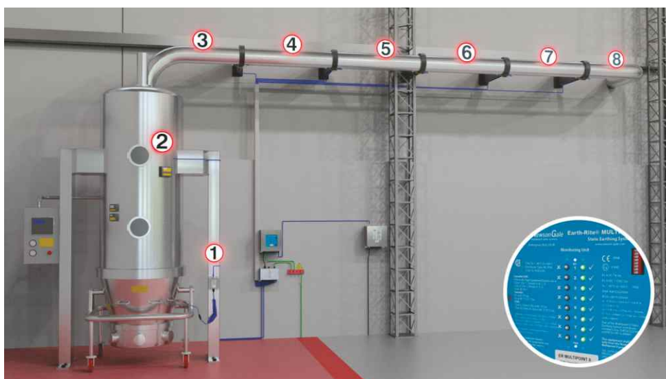
This example demonstrates the Earth-Rite® MULTIPOINT system grounding and monitoring parts of the conveying system which could be at risk of isolation.

Given such hazards exist within industry today; good housekeeping, strict maintenance practices, and ignition risk identification and mitigation are paramount in mitigating a dust explosion.