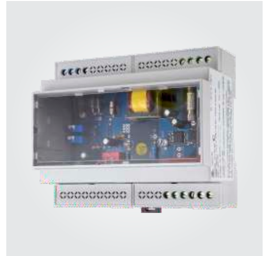
Earth-Rite OMEGA II

Two volt free changeover contacts can be used to switch power to additional ground status indicators or interlock with the process to shutdown product transfer when the Earth-Rite OMEGA II detects an open circuit on the path to ground.