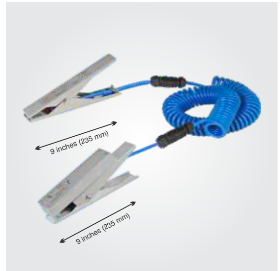
Bond-Rite EZ with large heavy duty clamp and 5 m (16 ft.) of Cen-Stat™ protected cable. Also available with standard size heavy duty clamp.