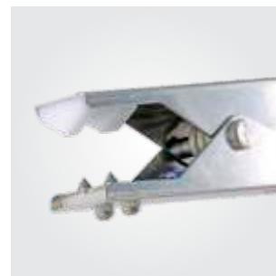
Tungsten Carbide Teeth