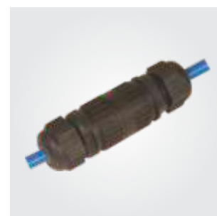
In-Line Quick Connect.

The Bond-Rite® EZ forms part of the Bond-Rite® range of Static Grounding and Bonding Equipment available from Newson Gale Ltd