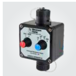
Universal Resistance Tester Product Code: URT.