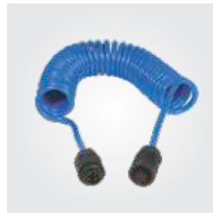
Cen-Stat cable supplied with male and female In-Line Quick-Connects.

The spiral cable provides effective retractability when the clamp is not in use, ensuring the cable is neatly stowed and safely out of the way.