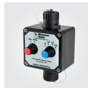
Universal Resistance Tester Product Code: URT.