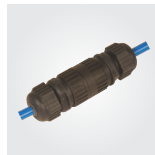
In-Line Quick Connect.

The Bond-Rite® EZ forms part of the Bond-Rite® range of Static Grounding and Bonding Equipment available from Newson Gale Ltd