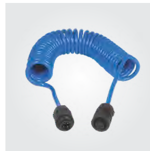
Cen-Stat cable supplied with male and female in-line Quick-Connects.

The spiral cable provides effective retractability when the clamp is not in use, ensuring the cable is neatly stowed and safely out of the way.