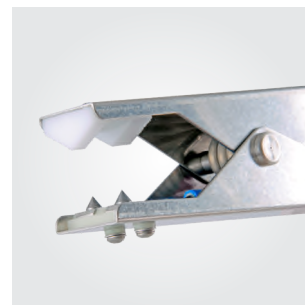
Tungsten Carbide Teeth