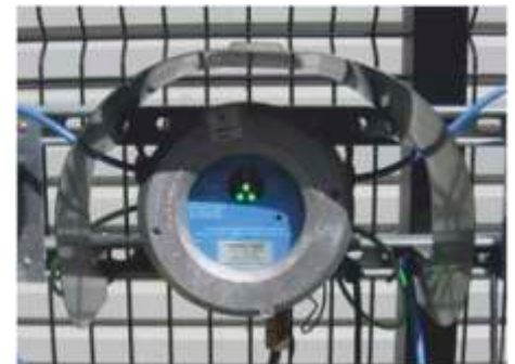
Ground status indicators showing positive grounding of road tanker truck