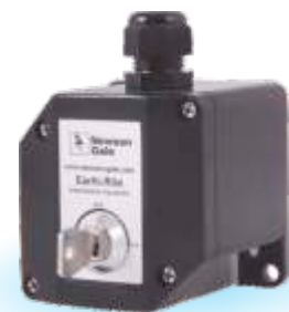
Product Code: ER2/MSKS (Europe) ER2/MSKSU (US, Canada)

The Earth-Rite System Options forms part of the Earth-Rite range of Static Grounding and Bonding Equipment available from Newson Gale