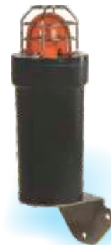
Product Code: STROBE01/A (Amber strobe)