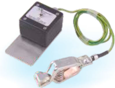
Product Code: RTRT

Note: If the system's grounding point has a high resistance connection to ground (earth), the Static Ground Verification check will not allow a permissive state. Should the Tester fail the installation it is advisable to measure the resistance of the RTR system's grounding point to ensure it is not higher than levels recommended in local standards and regulations.