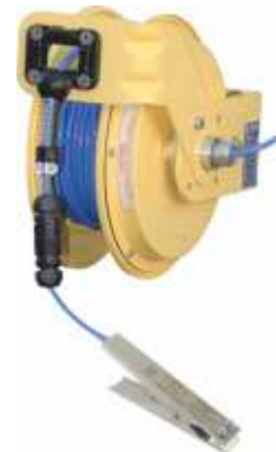
Product Code: VESM02