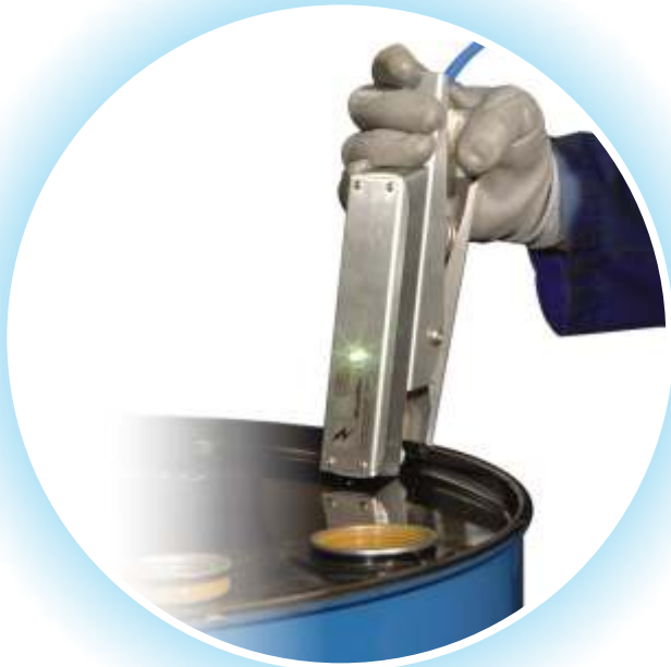
Pulsing LED confirms equipment is grounded