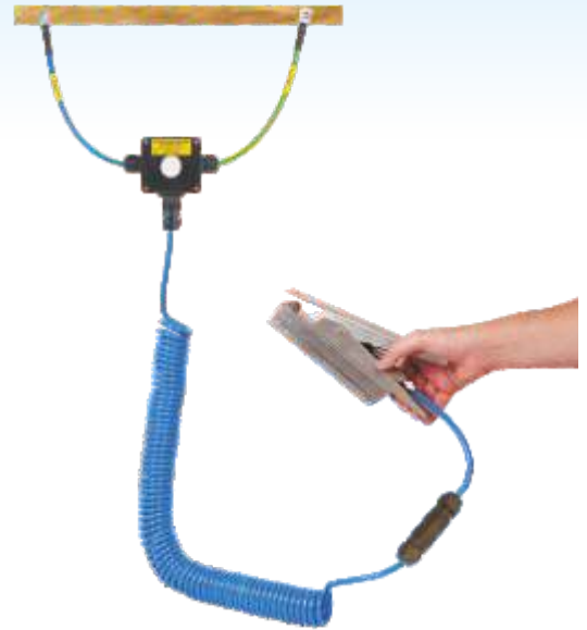
Bond-Rite CLAMP supplied with 2 conductor cable, junction box, clamp stowage pin and grounding leads. Circuit monitoring board and battery mounted inside clamp. Grounding bus-bar not supplied.