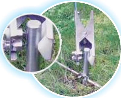
Quick release static grounding clamp supplied with the Earth-Rite MGV attached to buried rod.

When the Static Ground Verification and Continuous Ground Loop Monitoring checks are positive, a cluster of attention grabbing green LEDs pulse continuously informing the operator that the truck is securely grounded.