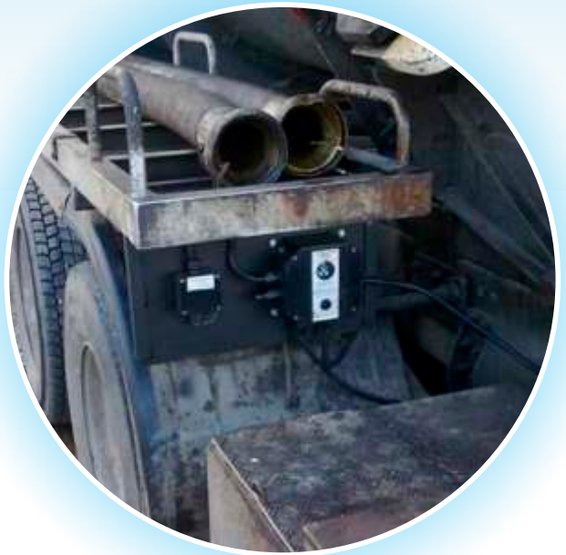
The Earth-Rite MGV static grounding system can be mounted on vacuum trucks and tank trucks.